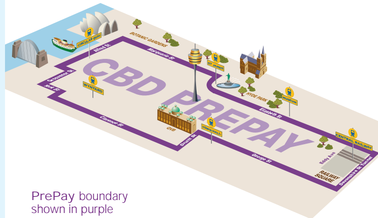
PrePay boundary shown in purple